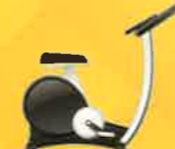
WORLD CLASS GYMNASIUM